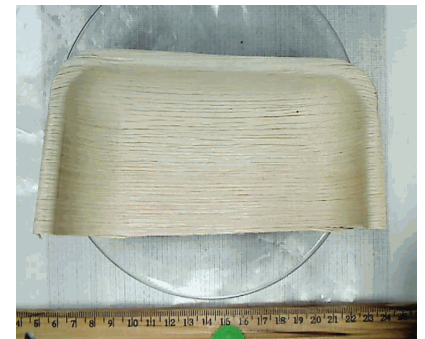
13524.7mg analyzed (1cm scale)

Disclosures: All work was done at Beta Analytic in its own chemistry lab and AMSs. No subcontractors were used. Beta's chemistry laboratory and AMS do not react or measure artificial C 14 used in biomedical and environmental AMS studies. Beta is a C14 tracer-free facility. Validating quality assurance is verified with a Quality Assurance report posted separately to the web library containing the PDF downloadable copy of this report.