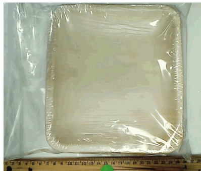
View of content (1mm x 1mm scale)