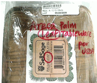
Package received - labeling COC

Laboratory Number Beta-558414 Percent modern carbon (pMC) 101.35 +/- 0.28 pMC Atmospheric adjustment factor (REF) 100.0; = pMC/1.000